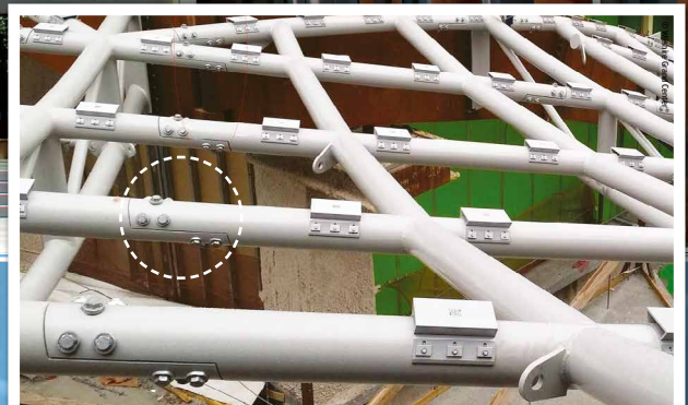
Hollo-Bolts used to splice together the circular HSS

As part of the development an ambitious design was proposed for a huge architectural curved glass skylight atrium above the entrance which would "drape" between the new skyscraper and its seven-story companion building known as the Podium. To bring the skylight in on budget engineers were tasked with finding solutions which would reduce costs while retaining the elegant and dramatic design. The skylight would also need to meet seismic design criteria to protect it, in the event of a major earthquake.