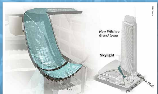
The 240 ft long skylight drapes between the two buildings