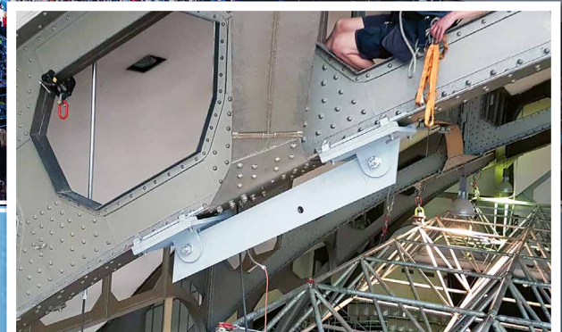
Custom bracketry system being installed

Welding or damage to the existing steel structure was not permitted due to the historical importance of the building, and so a new method of connecting to the steel was required. The solution would also need to be capable of carrying the necessary loads and prevent frictional slip.