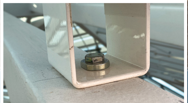
Hollo-Bolt used to connect the U-shaped bracket to the existing HSS

The original specification was to use self-tapping screws to connect U shaped brackets to the existing hollow structural sections (HSS) of the dome frame, before attaching the new frames that would hold the glass panels.