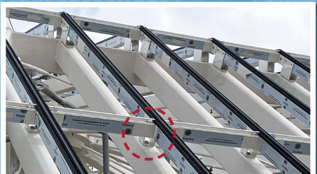
New glazing frames attached to the U-shaped brackets