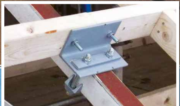
Purlin support cleat secured to existing RSA